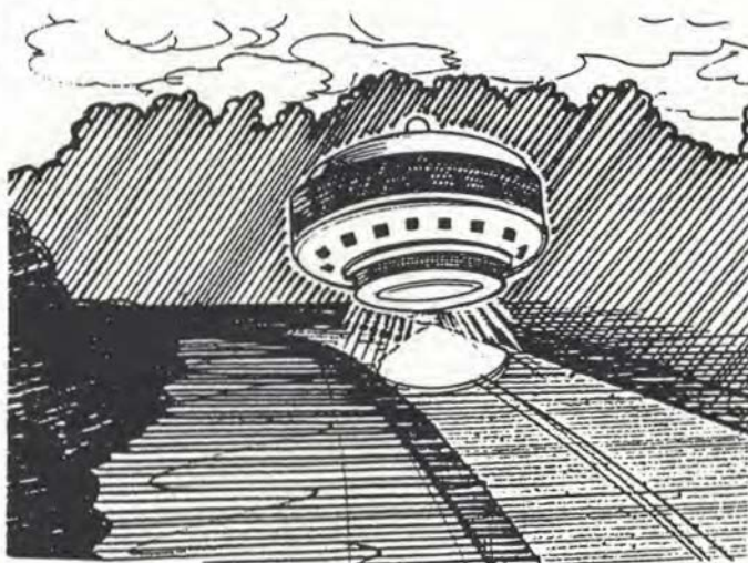
Top: The Gulf Breeze object, adapted from Mr. X's drawing. Bottom: An artist's rendering of one of the Polaroid photos, showing the object hovering over a road. Artwork courtesy of Susan Smith.